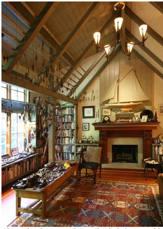
About the danger to hang plumb bobs over his head:

BEING A PERFECTIONIST, I WANTED THE PHOTOGRAPHY TO REFLECT THE QUALITY OF THE ITEM, THAT GOT ME INTO SPECIAL LENSES FOR THE CAMERA. I ALSO NAIVELY THOUGHT THAT AN ITEM SHOULD BE PHOTOGRAPHED HANGING. IF YOU'VE EVER WAITED FOR A PLUMB BOB TO COME TO REST, SOMETIMES HOURS FOR THE HEAVIER OF THEM, I GAVE UP ON THAT NOTION PRETTY QUICKLY. I DO SEEM TO ACCUMULATE FASTER THAN I HAVE SPARE TO DO THE PHOTOGRAPHY. 1 I'M ALWAYS SEVERAL HUNDRED BEHIND. AT SOME POINT I'M GOING TO TAKE A FEW WEEKS OFF TO CATCH UP ON THIS ELEMENT OF THE EQUATION.